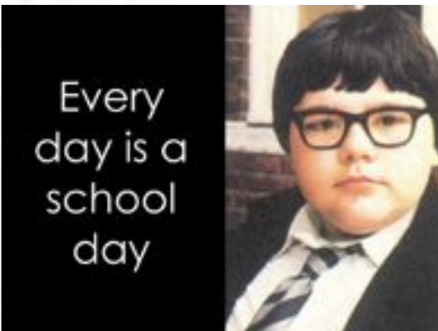
Add a "yeah I remember him" moment