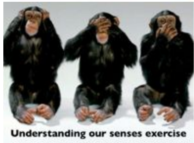
See how the image is filling the screen?