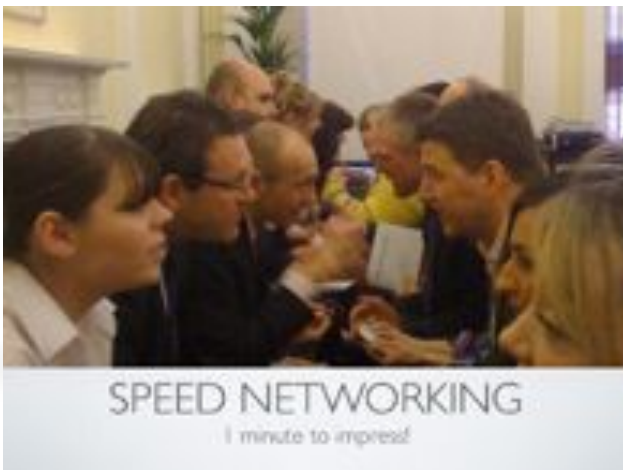
Use real images from your life

Here are a few guidelines of how we can make our slides look even better and give you an even greater edge to your speaking.