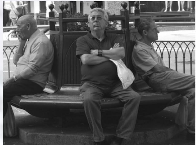
A slide I use for talking about body language

Believe it or not people have commented on my slides after a presentation and often people remember me partly from the slides that I use. Slides like a good story can be memorable, it's part of our job to be memorable. Slides are another tool in our toolbox.