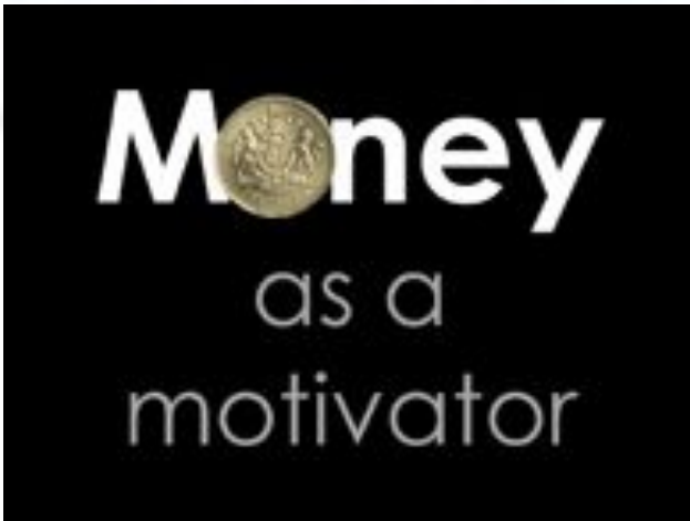
The coin brings a dull slide alive

Here are a few guidelines of how we can make our slides look even better and give you an even greater edge to your speaking.