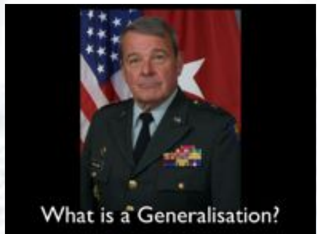
A bit of fun to raise a titter

Take notice of billboards next time you pass them in the car. How many words do they have on them? What is their key element? What can we learn from them in our slide design?