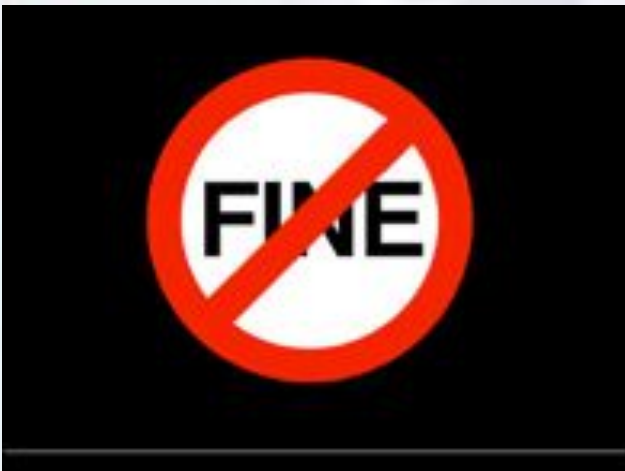
Big and bold

I have seen three types of speakers - speakers who never use slides, speakers who use great slides and speakers who use dull ones. Can you remember a slide with eight bullet points in Times New Roman? Death by Powerpoint needs to die once and for all.